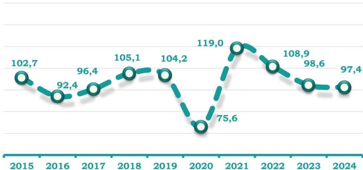
This chart depicts the number of registered marriages in Uzbekistan from 2015 to the first half of 2024 (January to June), with the unit in thousands.

Divorces in most cases occur during the first five years of marriage. According to the State Statistics Committee, the number of decisions in 2022 increased by 10% compared to 2020. This indicator shows that it is related to disagreements and financial difficulties between young families. Most of the divorces are observed in young families who do not have economic stability.